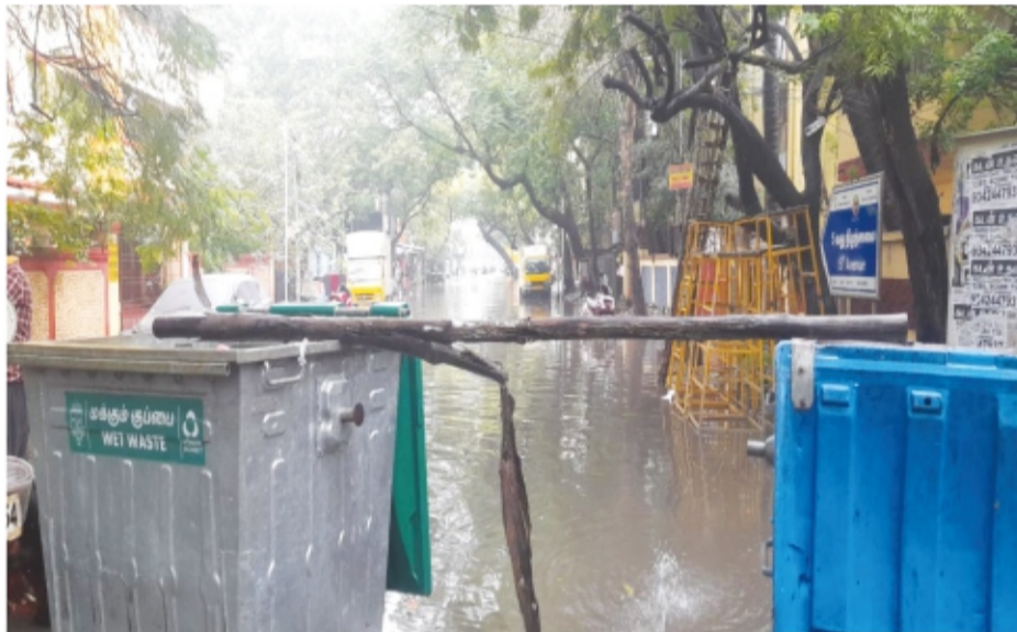
Some good samartians blocked 5th Avenue, Ashok Nagar by blocking with two garbage bins. Has the rain lashed on Thursday. The water was deep to 3 ft high, on the other side GCC pulling out stagnate rain water through motor pumps.

To streamline on-road parking, the city traffic police must plan to make the process of issuing 'no objection certificates' (NoCs) to restaurants stricter. They must formulate a system to regularise the parking at food joints. As per the system, every restaurant owner should show that he or she has sufficient parking space for the customers and obtain a NoC to get the license renewed by the corporation. If they fail to comply with the norms, they are not given an NoC. Most of the time, the vehicles create chaos and affect the already slow flow of traffic.