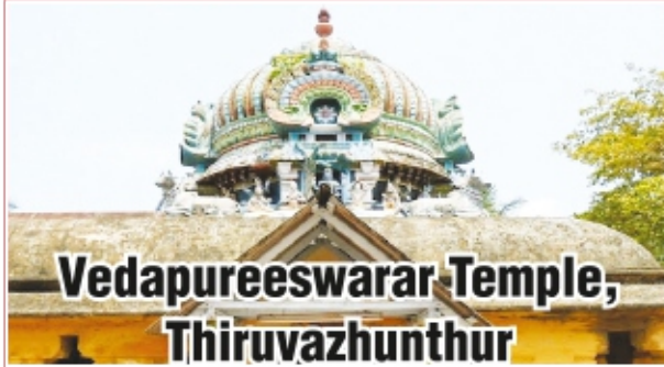
Vedapureeswarar Temple, Thiruvazhunthur

This is the 155th Thevara Paadal Petra Shiva Sthalam and the 38th sthalam on the north side of river Kaveri in Chozha Nadu. During ancient times this place was called Santhanaranyam with sandalwood trees.