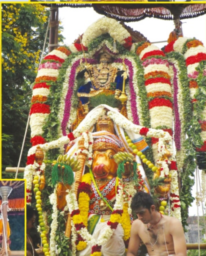
Adhikara Nandi Vahanam