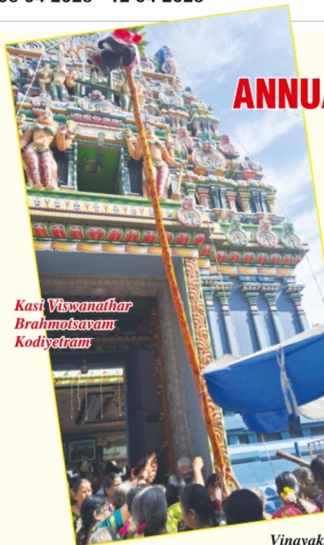
Kasi Viswanathar Brahmotsavam Kodiyetram