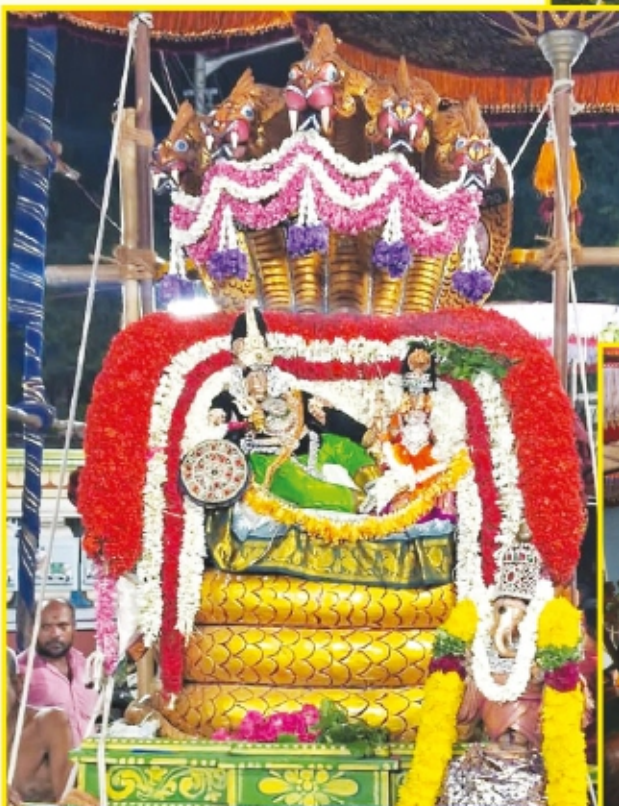
Adishesan Panchamurthy Vahanam